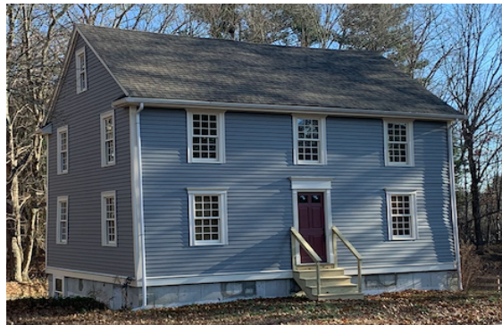
Let the interior renovations begin!