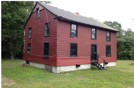
From this, to...