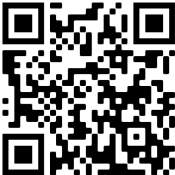
Lowell Mason House Website

Thanks for your consideration and support giving others the gift of music!