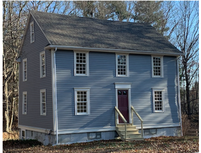
From this.....to this !