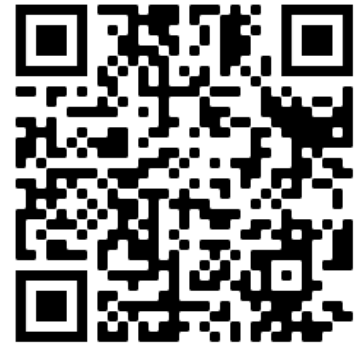
2021 LMH Lesson Plan Winners