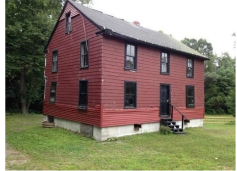
The house in 2013 before the exterior updates.

We've made tremendous progress over the years since we first acquired the House. We've moved it to a new site on a new foundation, installed a new roof, new siding, new windows, new doors, and painted the outside. The before picture is featured here: