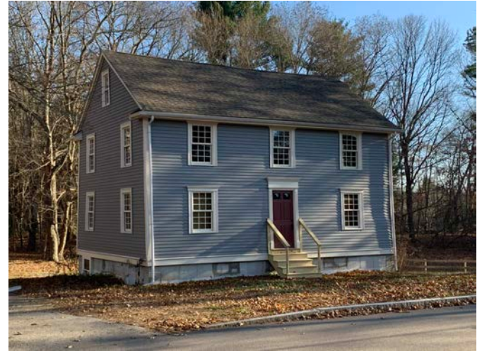
The house with new front stairs, November, 2020 .

House Update – Tremendous progress has been made since acquiring the house ten years ago. We moved it to a new site on a new foundation, installed a new roof and gutters, new siding, new windows, new doors, and painted the exterior. In 2020, the photo above shows the new stairs to the front door and inside, stairs connecting the first floor with the lower garden level were installed at the same time. There is still lots of work to be done, including: connecting water, sewer, electric, and gas lines; installing an ADA approved bathroom; and installing new electric wiring, floors, and walls; and creating handicapped access. https://lowellmasonhouse.net/projects